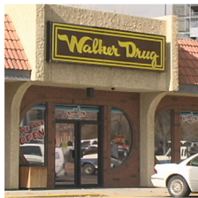
Walker Drug - Grand Junction, CO