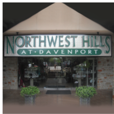
Northwest Hills Pharmacy, Austin, TX