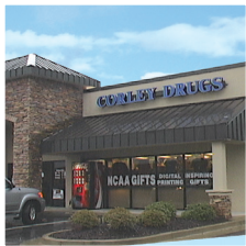
Corley Drugs - LaGrange, GA