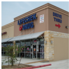
Lifeshek Drug, Rosenberg, TX