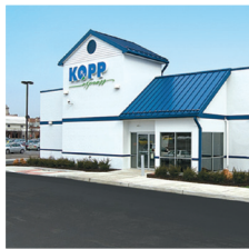
Kopp Drug - Allentown, PA