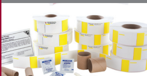
Compatible Kits for Automation Including Thermal Labels Used in Vial Filling Robots