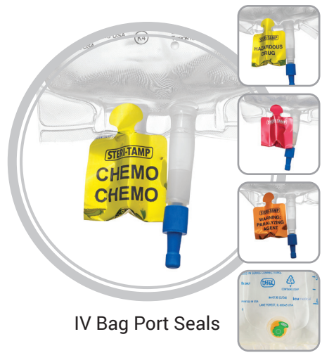
IV Bag Port Seals