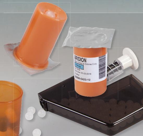
Easy Fill Vials w/ Plugs 7733 - 15mL Amber 7735 - 30mL Amber