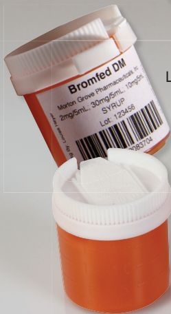
20475 Laser Labels