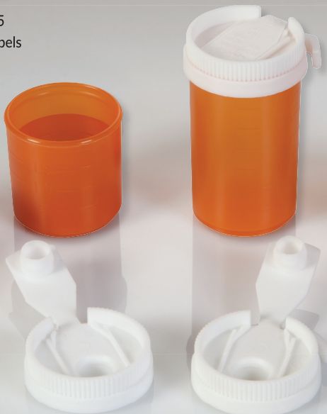
HCL® Tamper Tuf Vials w/ Caps 7741 - 15mL Assembled 7748 - 15mL Unassembled 7743 - 30mL Assembled 7749 - 30mL Unassembled