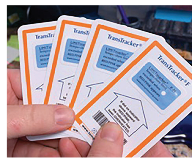
TransTracker F monitors medication for heat excursions and provides a visual indication for the patient on receipt